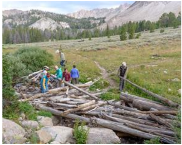
Cleaning Chamberlain Creek ford