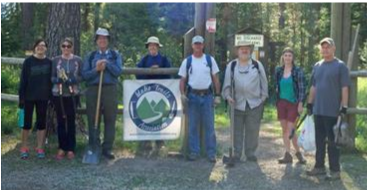
Trail Volunteers in northern Idaho

Eight volunteers spent a beautiful day improving the Mickinnick Trail on the Idaho Panhandle National Forest in northern Idaho. Eight logs were removed, fifty seven water bars were cleaned and three and a half miles of trail were brushed out. Four benches were repaired and painted and a pole fence and gate were also rebuilt on this project!