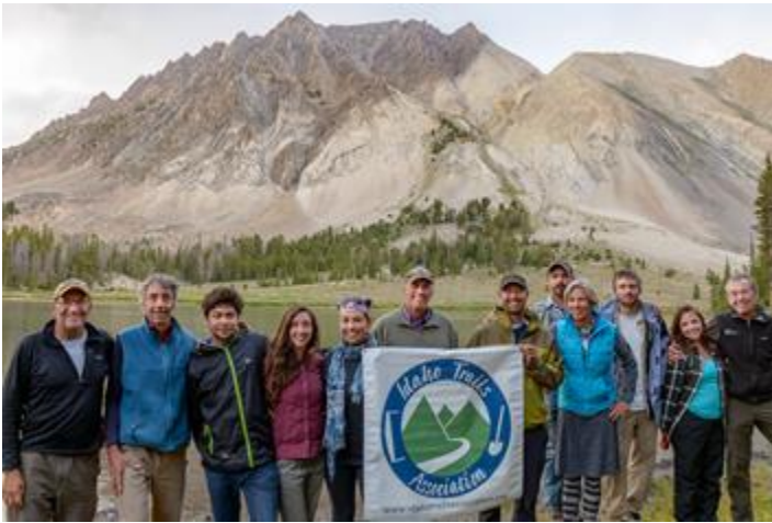
White Clouds Wilderness Volunteers

Ten volunteers spent the week in the newly established Boulder White Cloud Wilderness clearing trails and upgrading the trail system. ITA partnered with the Idaho Conservation League to accomplish this weeklong project in Central Idaho. Volunteers cleared trees, rocks and resurfaced the trail in to the Chamberlain Lakes Basin. We also reopened the Chamberlain Creek Trail. We had two professional photographers on the project to photograph the area and record the events of the week.