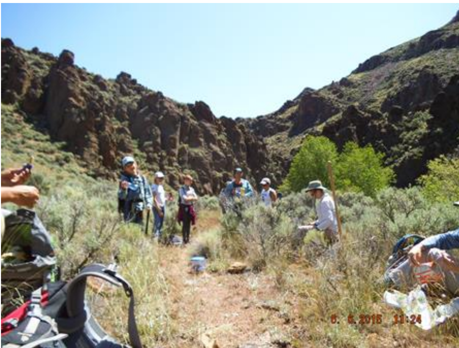
Volunteers having lunch and discussing the afternoon's project plans, Little Jacks Creek Wilderness, Owyhee Canyonlands

In June we held our first Crew Leader College to help train and certify crew leaders in crosscut saw skills, trail clearing specifications, and how to make trail work safe and fun. In fact, ITA provided training for several other organizations that have an interest in trail maintenance and traditional skills.