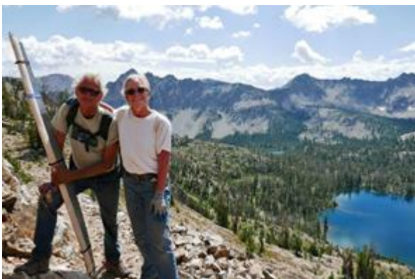
Alice Lake Volunteers, Sawtooth Wilderness

Ten volunteers spent a week in July at Alice Lake in the Sawtooth Wilderness. The project work was concentrated on the trail linking Alice Lake to the Tin Cup Trailhead. Fifteen hundred feet of trail tread was resurfaced through a talus slope, three miles of trail were brushed and eighty three waterbars were cleaned and rebuilt. This project was supported by grants from REI, Cabela’s and the Sawtooth Society.