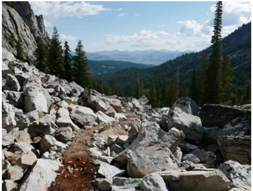
Alice Lake trail, Sawtooth Wilderness

Number of volunteers– 238 Volunteer field hours– 2,562 Monetary value- $43,239 Miles of trail cleared- 60.5 Miles of trail reconstructed- 22.5 New construction- 5780 feet Logs cut from trail– 367 Water bars cleaned– 459 Tread resurfacing– 2200 feet Rock removal– 7 miles Wilderness campsite naturalization- 11 Human waste removal- Piles Trash packed out– 84 Pounds Reconstructed and painted benches– 4 Reconstructed fence- 400 Feet Gate installation– 2