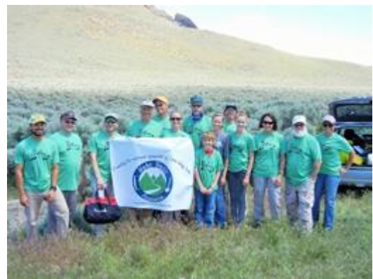
National Trails Day Volunteers