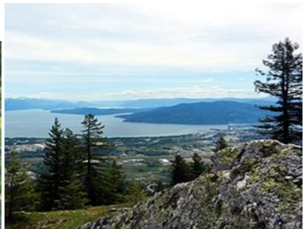
View from Mickinnick Trail